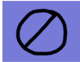
BUDDHISM...believes no God or gods exist

Muslims believe there is the one almighty God, named Allah, who is infinitely superior to and transcendent from humankind. Allah is viewed as the creator of the universe and the source of all good and all evil. Everything that happens is Allah's will. He is a powerful and strict judge, who will be merciful toward followers depending on the sufficiency of their life's good works and religious devotion. A follower's relationship with Allah is as a servant to Allah.