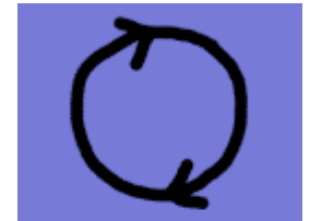
NEW AGE...believes we ourselves are God

New Age promotes the development of the person's own power or divinity. When referring to God, a follower of New Age is not talking about a transcendent, personal God who created the universe, but is referring to a higher consciousness within themselves. A person in New Age would see themselves as God, the cosmos, the universe. In fact, everything that the person sees, hears, feels or imagines is to be considered divine.