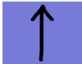
ISLAM...devoted to one transcendent God

Though a Muslim honors several prophets, Muhammad is considered the last prophet and his words and lifestyle are that person's authority. To be a Muslim, one has to follow five religious duties: 1. Repeat a creed about Allah and Muhammad; 2. Recite certain prayers in Arabic five times a day; 3. Give to the needy; 4. One month each year, fast from food, drink, sex and smoking from sunrise to sunset; 5. Pilgrimage once in one's lifetime to worship at a shrine in Mecca. At death -- based on one's faithfulness to these duties -- a Muslim hopes to enter Paradise. If not, they will be eternally punished in hell.