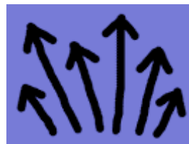
HINDUISM...infinite manifestations of god

Hindus see their position in this present life as based on their actions in a previous life. If their behavior before was evil, they might experience tremendous hardships in this life. A Hindu's goal is to become free from the law of karma...to be free from continuous reincarnations.